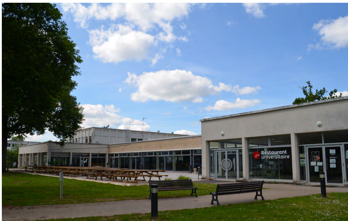
Photo : Façade du restaurant CROUS - Campus Beauvais

Remember to take some cash (euros) with you when you arrive in France!