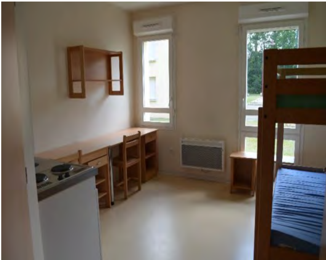
Photo : Standard room in bois J

For more information: https://www.caf.fr/